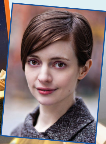
Emily St. John Mandel